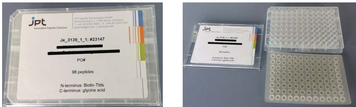
Figure 2: Left: Microtiter-Plate delivery format, lidded and sealed; Right: individual components: Lid, seal and microtiter-Plate

The microtiter plate is delivered with a lid as well as an additional sealing mat, keeping environmental air and humidity out of the individual wells. Please see figure 2 for details: